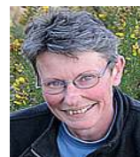
National Gorse Coordinator