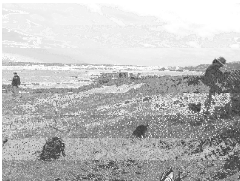
CVA team removes sea spurge at Ocean Beach

revegetation trial site established by the