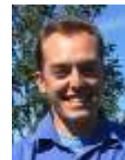
Project Officer - BPG