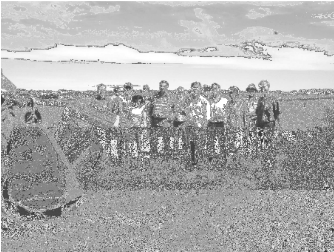
NGT members viewing a “Gorse Groomer”