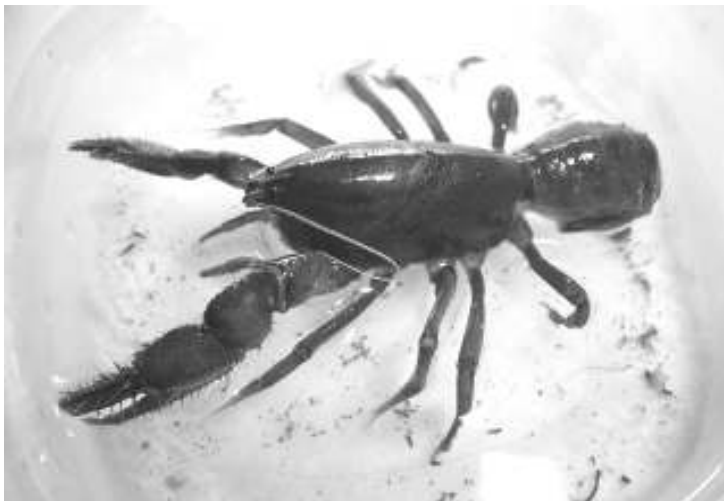
E. fossor adult female from West Ulverstone carrying eggs under her tail