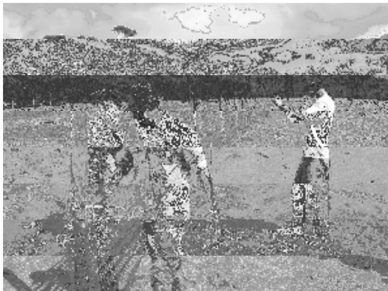
CVA team conducts fence maintenance at the King River Delta to assist the King River Action Group.

King River Action Group, assisting with fence maintenance. The trial is on a mine tailing delta at the mouth of the King River and its aim is to determine what (if any) revegetation method might work in this environment.