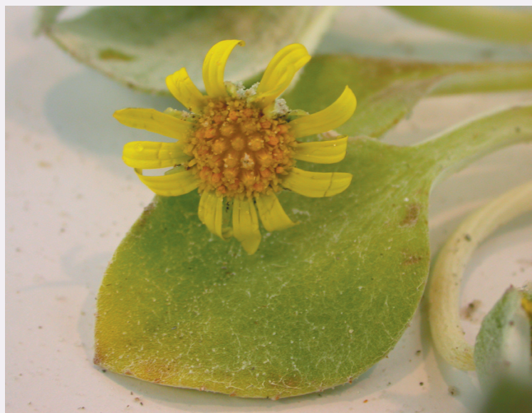
Flowering head and leaf of Arctotheca populifolia